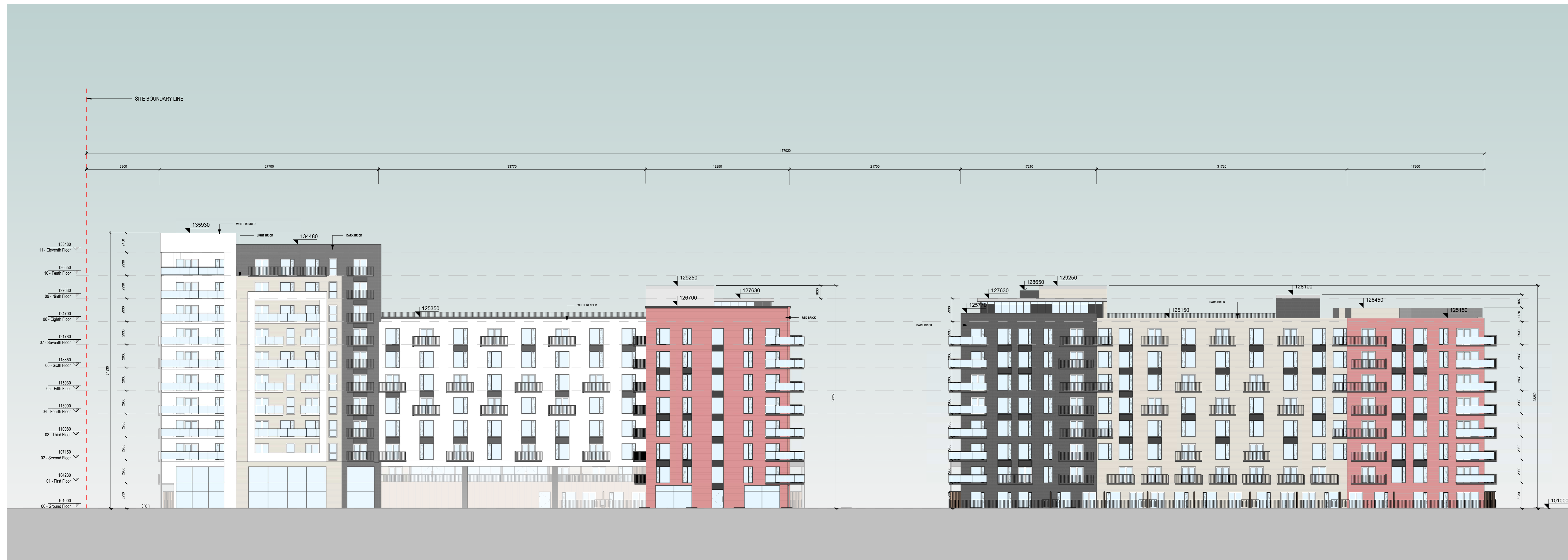
B1 Block B - Elevation B1 1:200